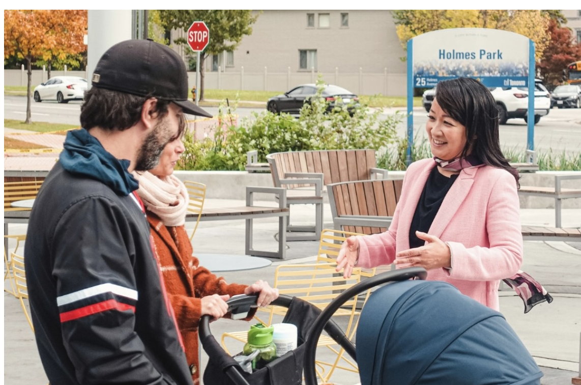
Great connecting with neighbours to envision the future of Holmes Park during a fun neighbourhood playdate. I had the opportunity to hear from so many of our community members on shaping the second phase of Holmes Park. Thanks to all who joined us!